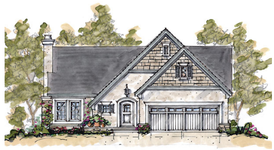
Alternate Elevation (Roslyn)